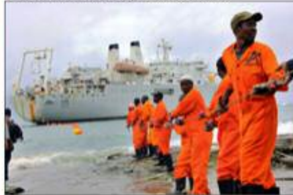
Investment into the African telecoms sector has hit $18bn since 2001

First Published 2010-03-24, Last Updated 2010-03-24 12:02:03